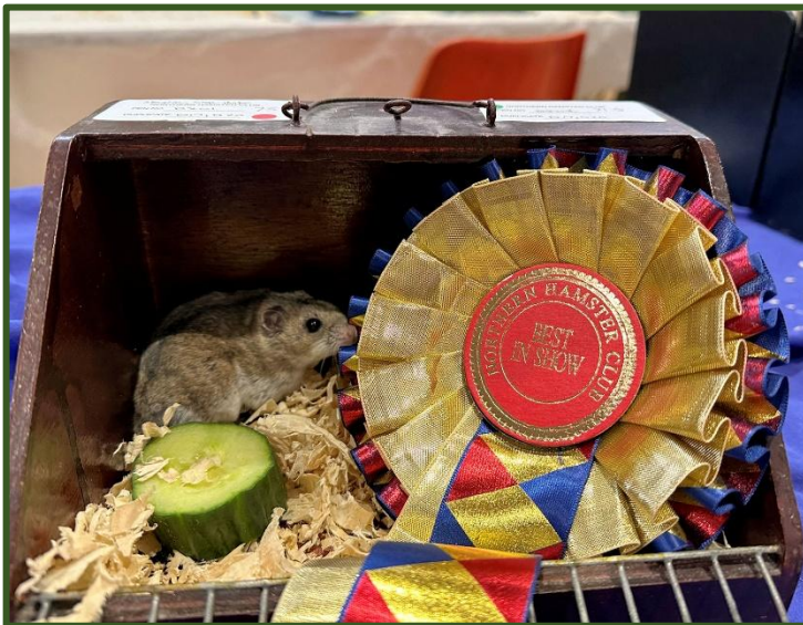
BIS Dwarf – Lilliput's Fortune