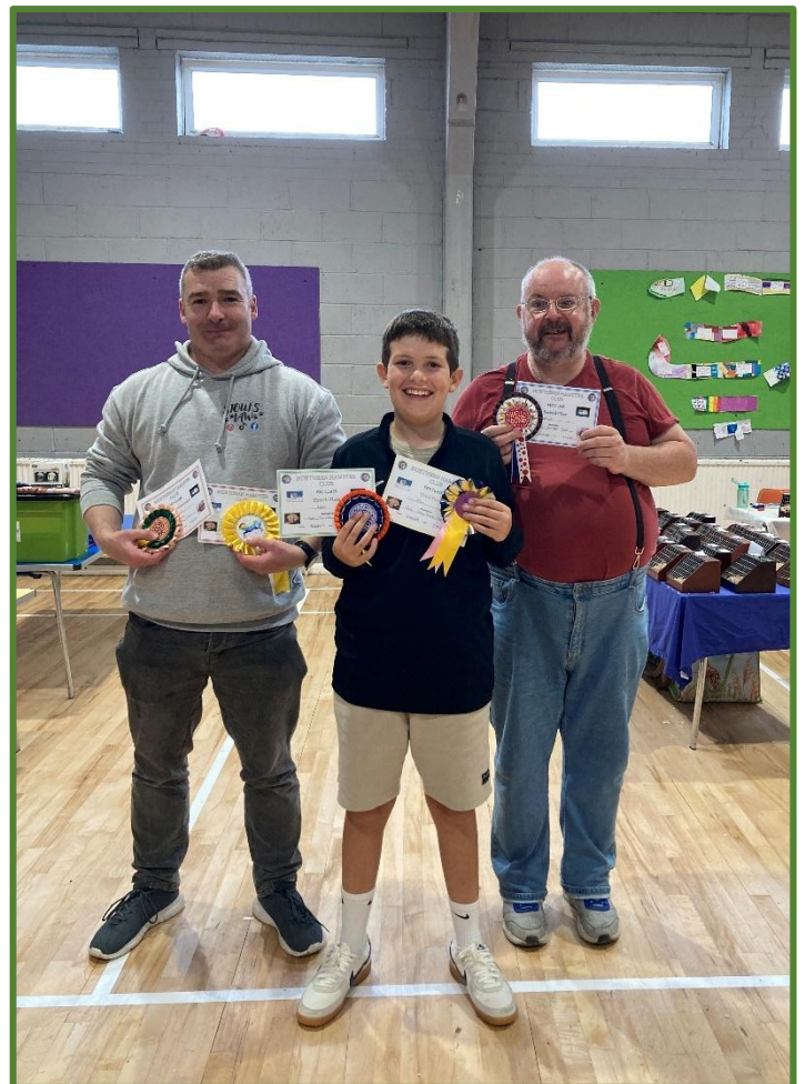
Pet class winners