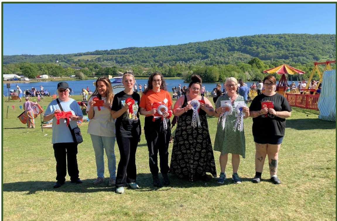
Rosette winners, Otley