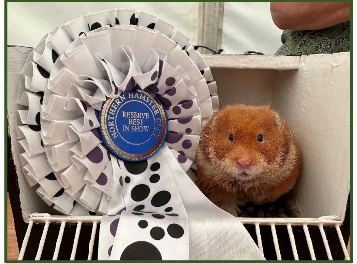
RBIS Syrian – Custard's Clara at Moonstone