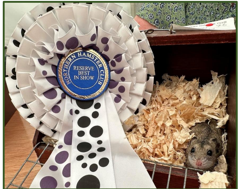
RBIS Dwarf – Lilliput's Fortune