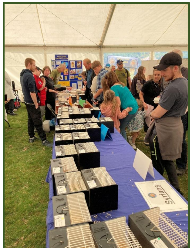
Hamsters on the bench at Otley