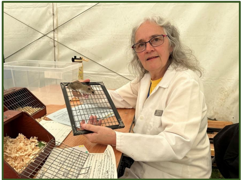
Dwarf judging at Otley