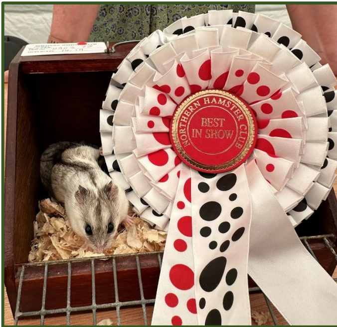
BIS Dwarf – Lilliput's Knotweed