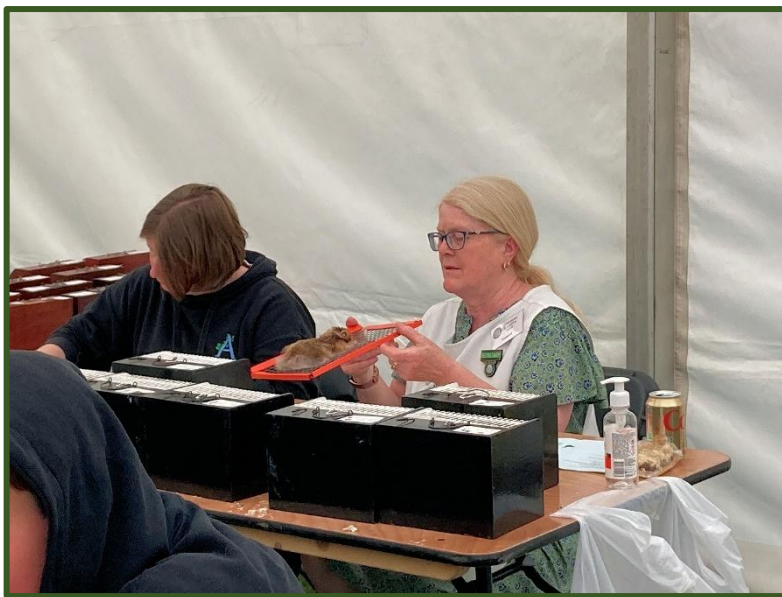
Syrian judging at Otley