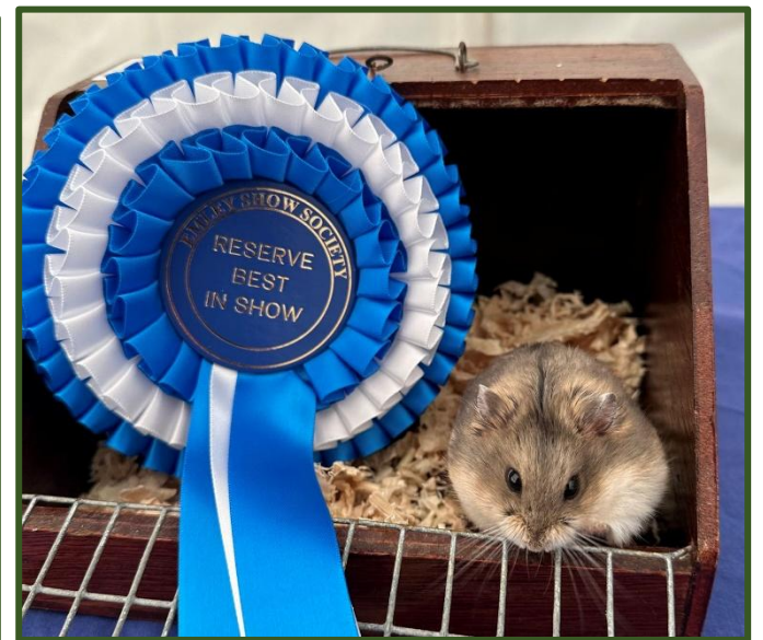
RBIS Dwarf – Lilliput's Bubblegum