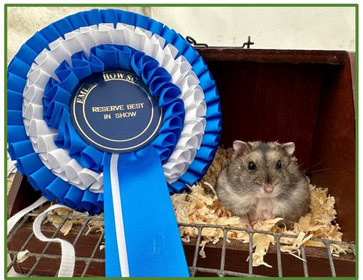
Reserve BIS Dwarf – Tristar's Tyler