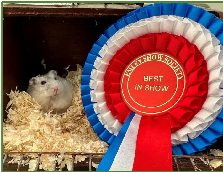
BIS Dwarf – Dawsons' Blaze