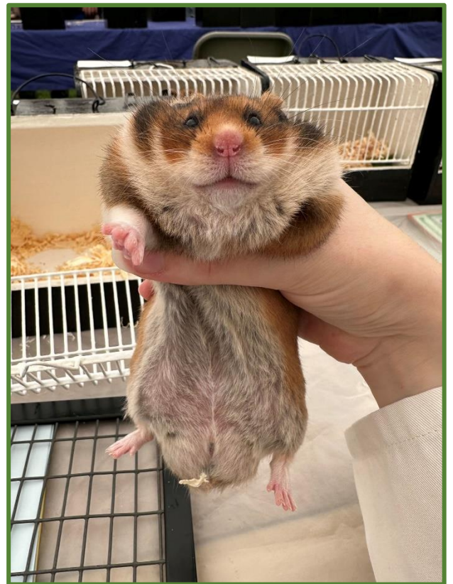
All set up and ready to go!