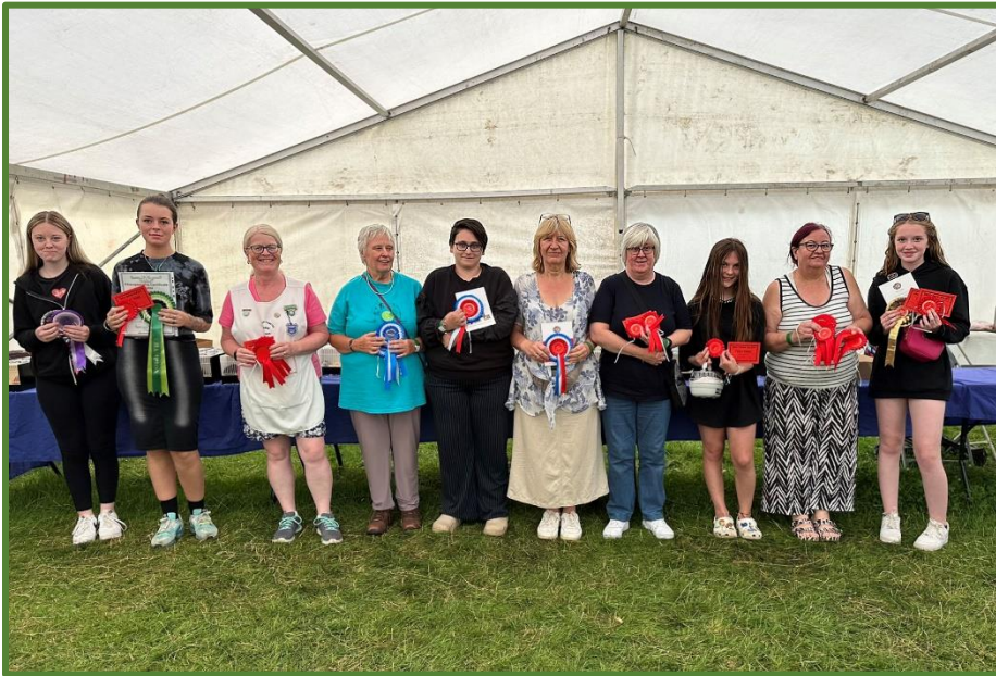
Emley Show rosette winners