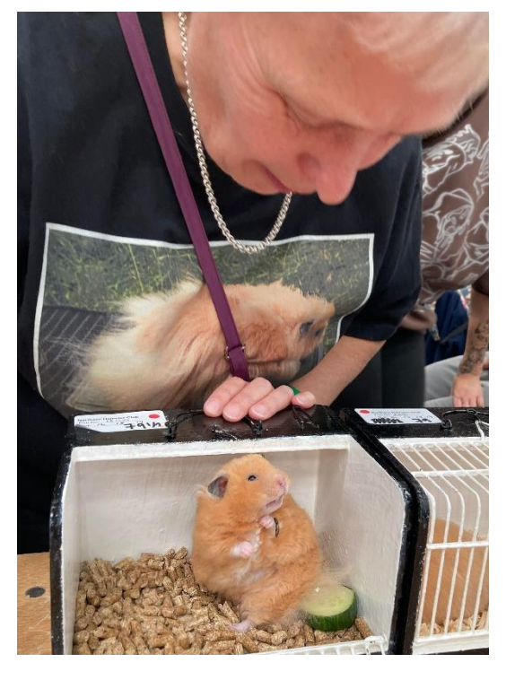
Some more Photos from the London Championship show