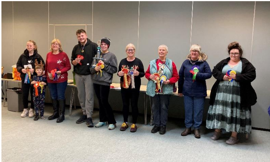
More photos from Mapplewell