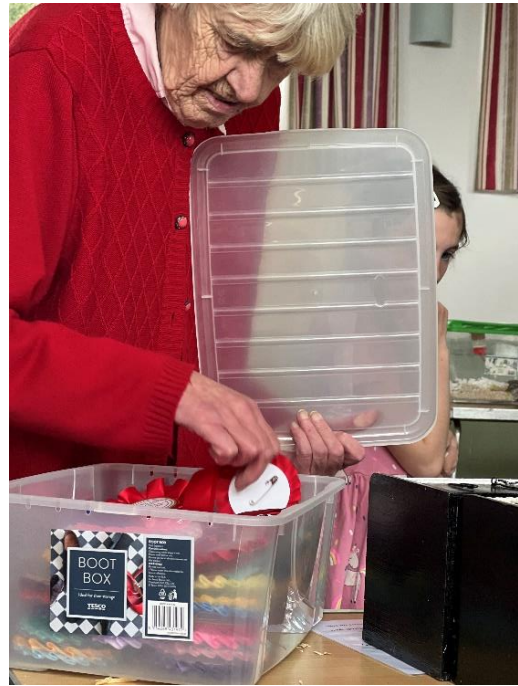
Photos of the Bath Hamster Show