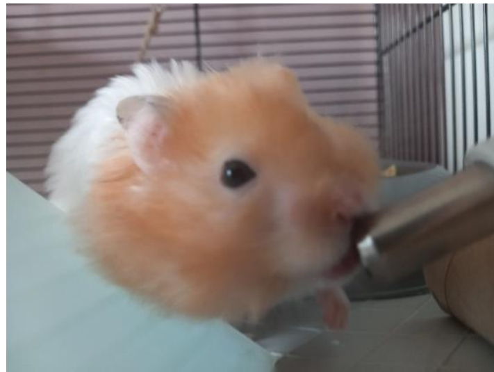
This is my hamster Scruff he's really energetic, he's a long-haired Syrian hamster. He loves running around his cage. This is Scruff drinking from his water bottle!