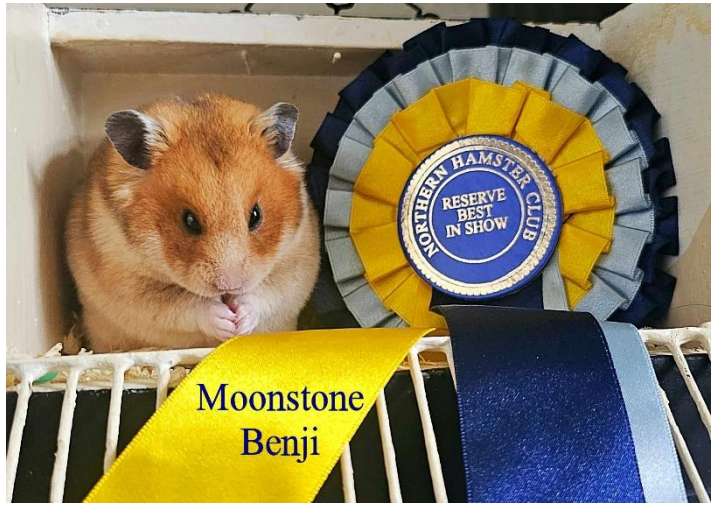
Winners from the Sheffield Show